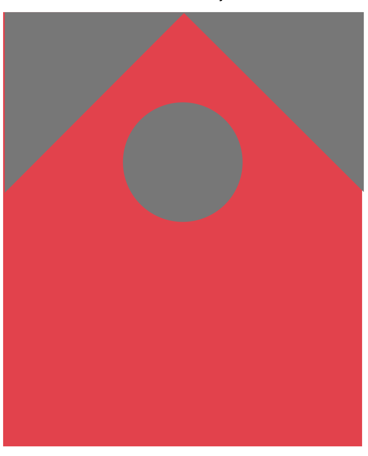
Also cut a 2" hole in only ONE Piece

You will cut TWO pieces As Shown in RED Only cut ONE Hole unless you want a backdoor!!! See the image below for the pieces you are cutting